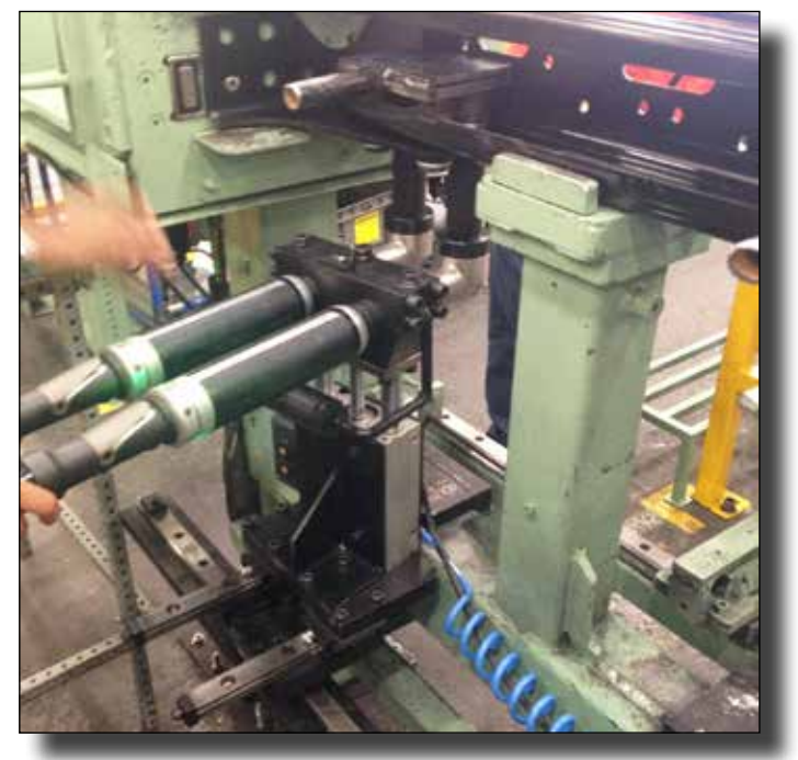
Rear Axle Assembly

Derramadero, Coahuila, Mexico: Truck Assembly