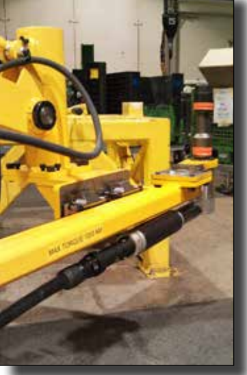
Tie Rod Adjustment