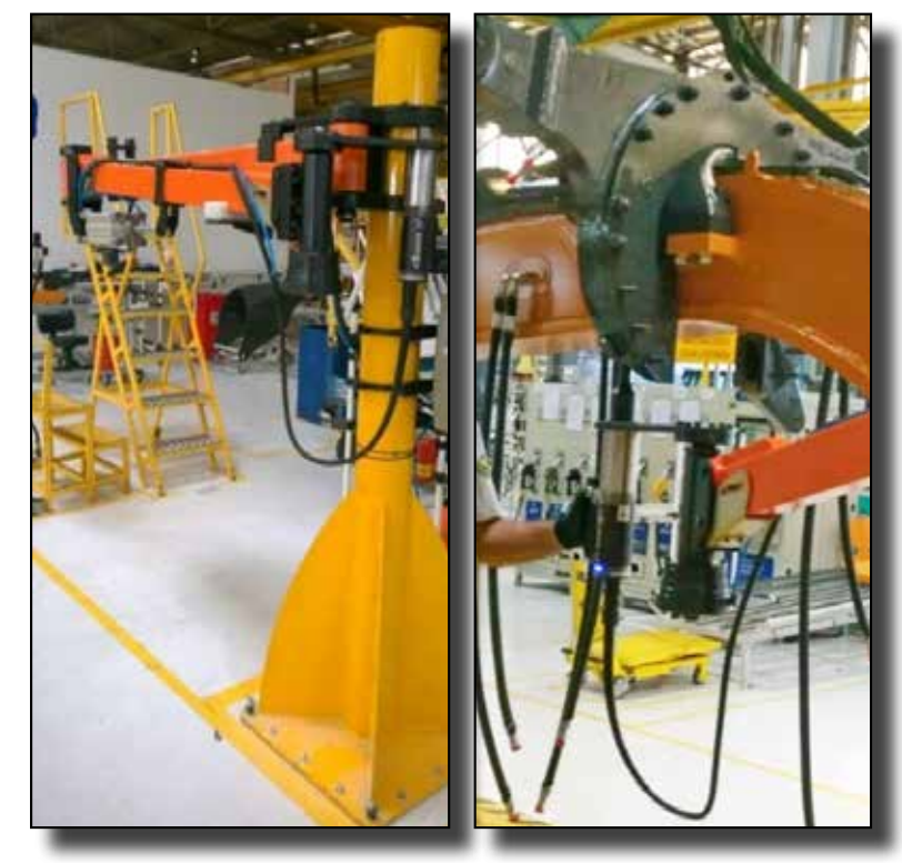
Final Assembly Tightening Car Swing Bearing