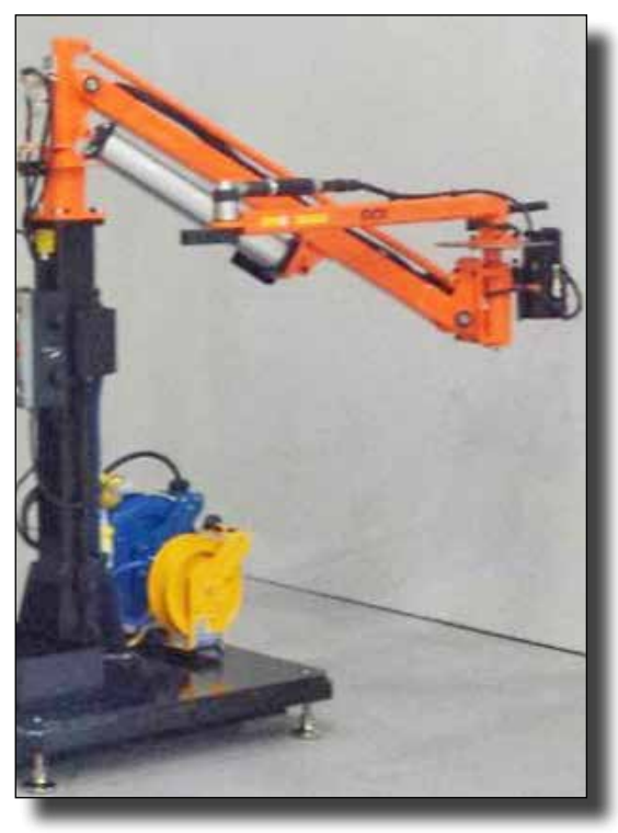
Slew Ring to Upper Target Torques = 183 nm, 475 nm, 610 nm

Northern Ireland: MH-3000 Series Material Handling Machine